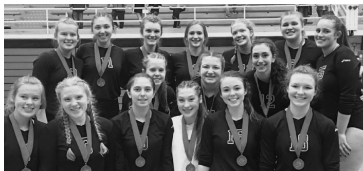
The 2017-2018 Green Wave Volleyball Team placed second at the District XI Class A Volleyball Championships in the Fall.