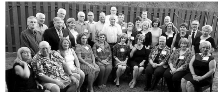
The Nativity BVM Class of 1972 recently held their 45th Class Reunion.