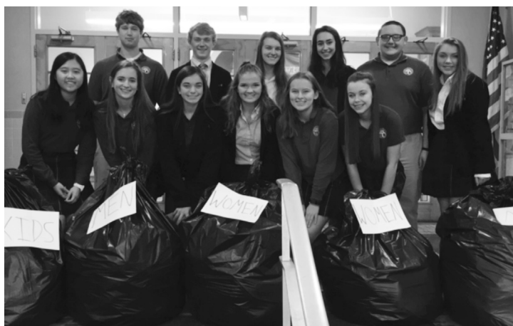
Nativity BVM High School's Interact Club recently concluded a winter clothing and coat drive to benefit Schuylkill Women in Crisis.

Friday, October 19, 2018 Annual Homecoming Football Game and Alumni Tailgate @ St. Clair Memorial Stadium