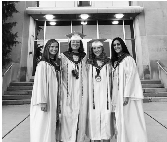
Congratulations to the 70 graduates of the Nativity BVM High School Class of 2019 who were offered a total of $7,838,146 in scholarships, grants and awards to further their education and accepted $2,518,472 of this money! 97% of the Class of 2019 will be attending a 4 year or 2 year university/college, trade school or the military.